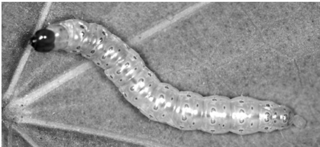
Figure 1. European Corn Borer larva on a cotton leaf. The body of the larva is typically pale brown or pinkish gray with dark middorsal lines on abdominal segments

The European Corn Borer (ECB), Ostrinia nubilalis (Hübner), is a major pest of corn in some regions of the United States. The insect ( Figure 1 ) was introduced into the U.S. from Europe in the early 1900s (Metcalf and Metcalf 1993) and rapidly spread across North America. It has a broad host range, including both monocots and dicots, that varies with climate, number of generations, and availability of preferred hosts. ECB in northern regions of the U.S. Corn Belt may have a single generation that feeds primarily on corn, while those in southern regions may have three or more generations utilizing a variety of hosts (Showers et al. 1982). The ECB is a recognized pest of corn, sweet corn, potatoes, beans, numerous vegetables, and flowers. It feeds on more than 200 plants, including many weeds. In recent years the ECB ( Figure 1 ) has been recognized as a potential pest of cotton, particularly in the Carolinas, where agricultural production includes a wide diversity of plants.