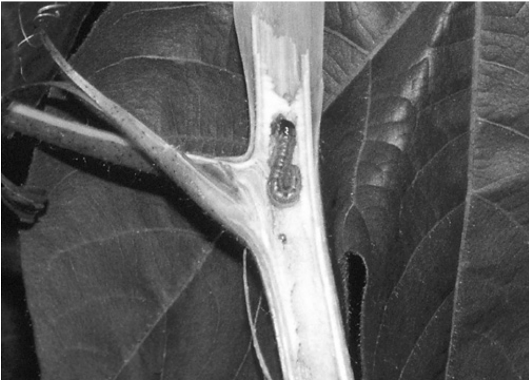
Figure 3. European Corn Borer larva and tunnel exposed by splitting the main stem of an infested cotton plant.