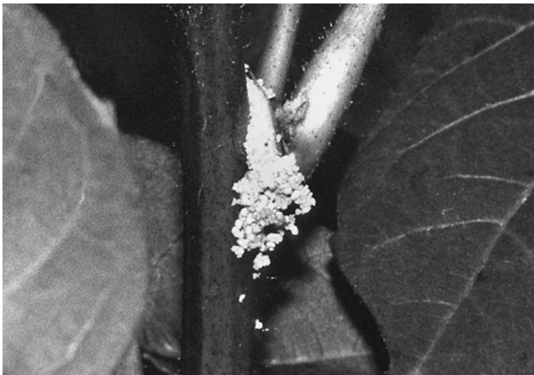
Figure 2. Characteristic sawdust-like frass created by European Corn Borer larva after tunneling into the cotton stem.

Reported in this study are observations of ECB damage to cotton in Leflore County, Mississippi, during 1993. These observations were made in 2-hectare research plots designed to measure differences in arthropod activity between unsprayed nontransgenic cotton, nontransgenic cotton managed and sprayed for cotton insects, and unsprayed transgenic cotton expressing insecticidal protein of B. thuringiensis (Bt cotton).