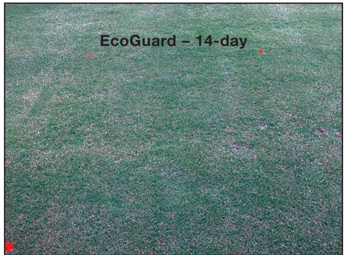
Dollar spot symptoms in an untreated control plot (left) and no dollar spot symptoms in the EcoGuard treatment (right) at Starkville, Mississippi, fall 2004.