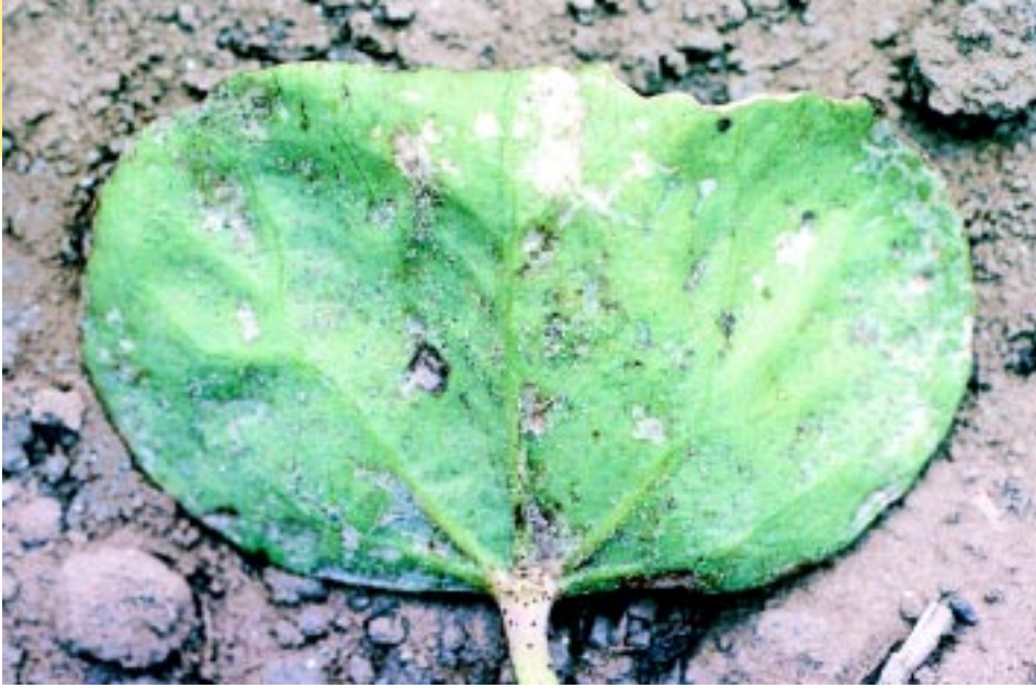
Figure 7. First symptoms of thrips feeding on a cotyledon cotton leaf.