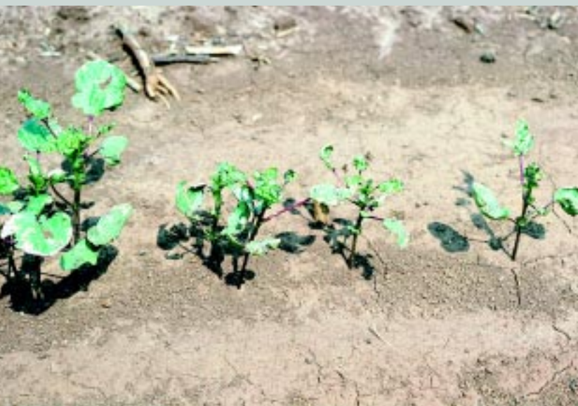
Figure 10. Thrips feeding symptoms.

Similar thrips feeding symptoms were described as early as 1930 for the tobacco thrips, Frankliniella fusca , on cotton in South Carolina (3). This phenomenon was also described in Louisiana by researchers at the USDA Tallulah Laboratory (6) (Figure 10). Cotton exhibiting these symptoms, i.e. loss of apical dominance and excessive branching, has been described as “crazy cotton” and also may be caused by other insects, diseases, and mechanical damage (Figure 11). Other problems related to thrips damage are increased seedling mortality, reduced plant height, reduced leaf area, delayed crop maturity, and yield loss (1).