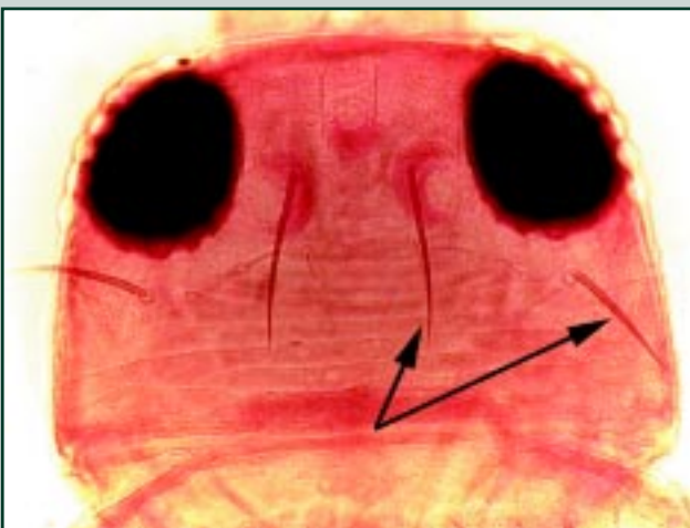
Figure 4. Characteristics that help identify eastern flower thrips.