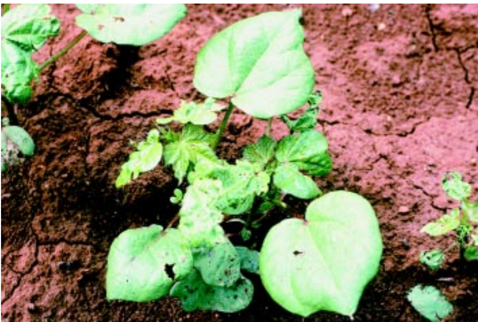
Figure 8. Cotton plants recovering from moderate-heavy thrips damage.