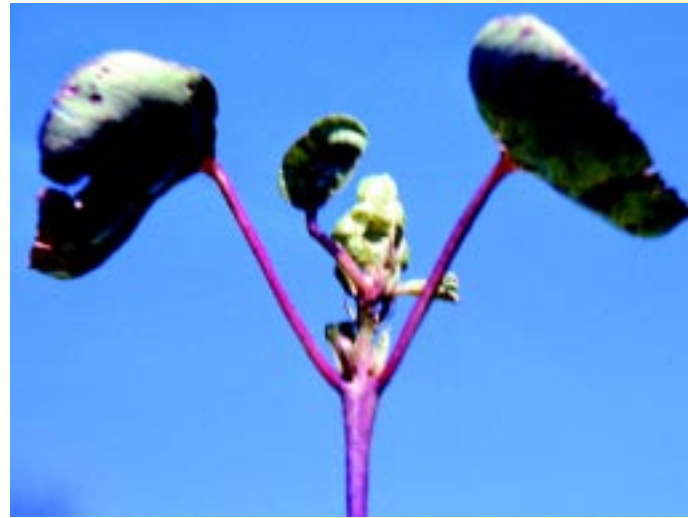
Figure 9. Loss of apical dominance occurs as a result of severe thrips feeding.

Immatures and adults show preference for the small leaves and stipules in the bud, resulting in ragged and crinkled leaves as they expand and mature. Size of the first few true leaves is often greatly reduced by thrips feeding (Figure 8). If feeding damage is severe enough to kill buds in the terminal, apical dominance is lost, and plants become excessively branched or distorted in appearance as secondary terminals form in leaf axils (Figure 9).