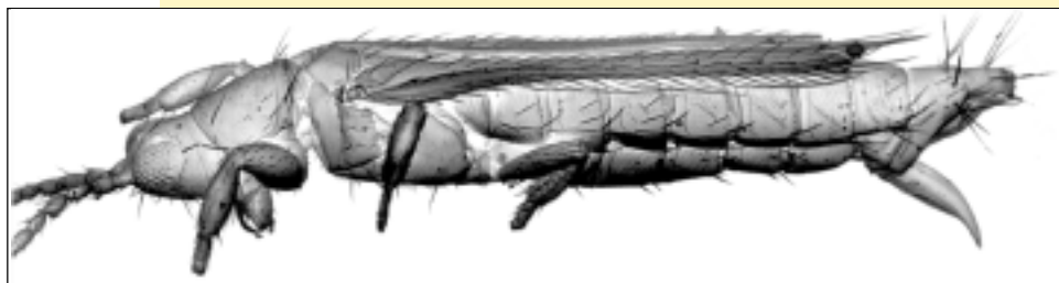
Figure 2. Western flower thrips, adult female viewed with a scanning electron microscope.

In cotton, the distribution of thrips species over time indicates population densities generally peak during the last week of May and the first week of June. Occasionally, three distinct peaks occur during the seedling stage of cotton. The multiple cycles develop during dry seasons, and overlapping generations from several species probably account for the deviation in cyclic behavior.