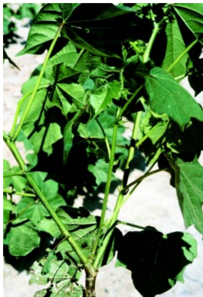
Figure 11. A developing cotton plant exhibiting symptoms of “crazy cotton.”

Randall Furr and Aubrey Harris of the Delta Research and Extension Center in Stoneville, Mississippi, collected thrips from this location for inclusion in the survey.