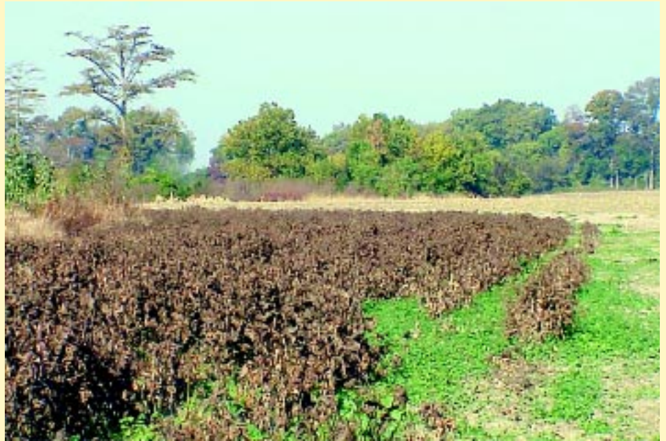
Figure 3. Weeds adjacent to cotton fields can serve as overwintering habitat for thrips.

Thrips dispersal across cotton fields occurs immediately after emergence. The type of flora adjacent to a field often can influence the degree of infestation and species present (Figure 3). After immigration into a cotton field, thrips feeding starts while cotton plants are in the cotyledon stage.