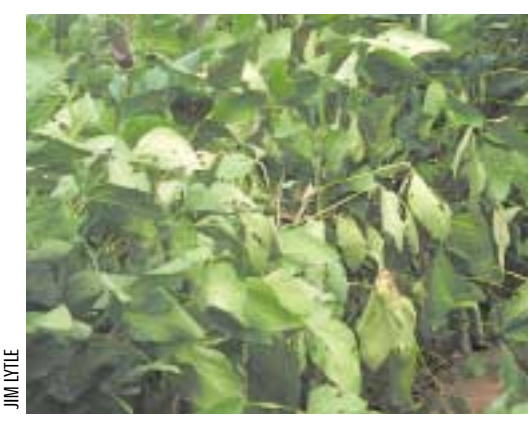
Soybean plants infected with Macrophomina showing one of the symptoms of charcoal rot – prematurely yellow leaves.

Symptoms of charcoal rot on soybeans include premature yellowing of leaves,