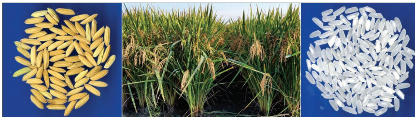
Figure 1. RU1104077 is an MSU-developed elite breeding line that is in the final stages of the variety release process.

Two other conventional-variety, elite-line entries produced yields that were comparable to that of Rex and were also within 80% of the yield of the top-yielding hybrid entry. These were RU1404154 (232 bushels per acre) and RU1404122 (230 bushels), which were tested for the first time in the on-farm variety trial and will be tested again in 2016. RU1404122 showed excellent