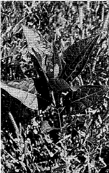
Figure 5. Pokeweed is a perennial weed which can grow quickly after emerging in early spring.