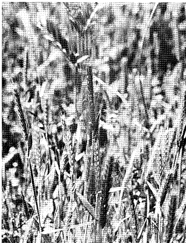
Figure 1. Little barley, a naturally occurring cool season grass, was easily killed with PPF herbicides.

Pokeweed may pose a special problem for no-till farmers. As Table 7 shows, pokeweed plants did not occur in high numbers in any plots in 1986, but they caused considerable soybean staining when the purple berries went through the combine (Figure 4). Grain elevators would probably dock soybeans with such stain. Pokeweed plants measuring 25 inches tall were observed April 29, 1987 (Figure 5). The burndown herbicides used in this study did not control large pokeweed plants. In many plots, regrowth was