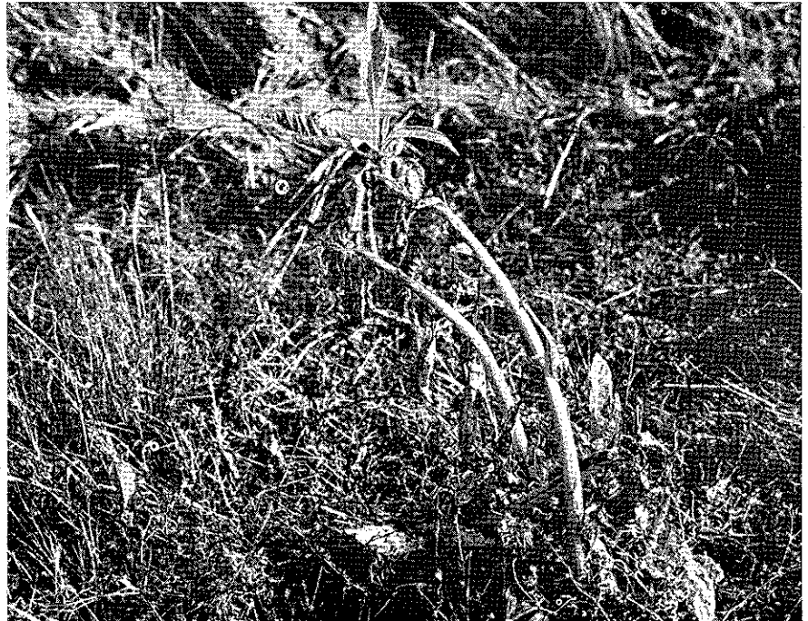
Figure 6. Regrowth was visible on this pokeweed in less than a week after receiving paraquat (PPF).