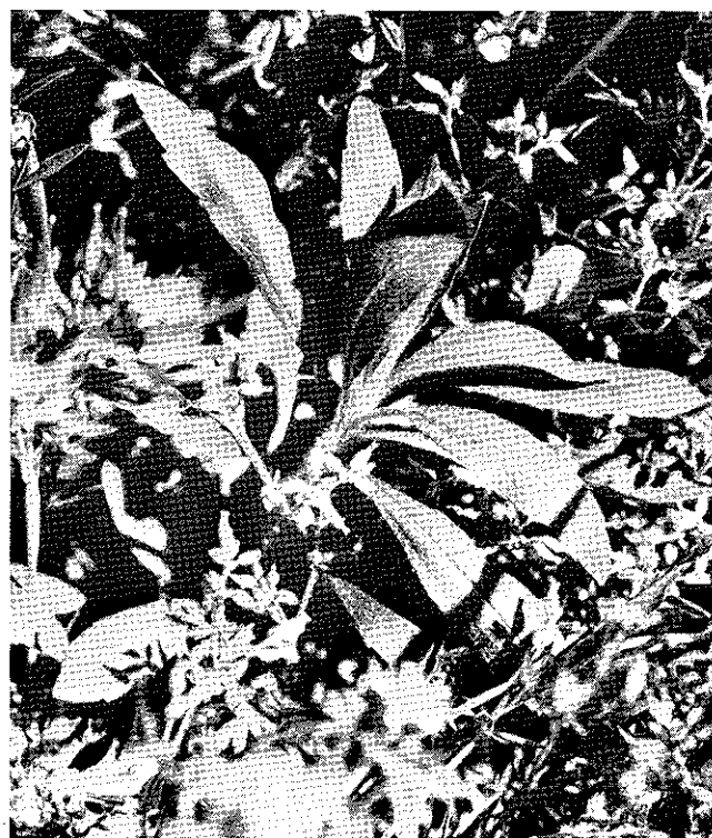
Figure 2. Competition from cool season weeds may have contributed to the decline of horseweed in non-till plots in 1985 and 1986. Horseweed germinates in the fall and lives through the winter in the rosette stage.