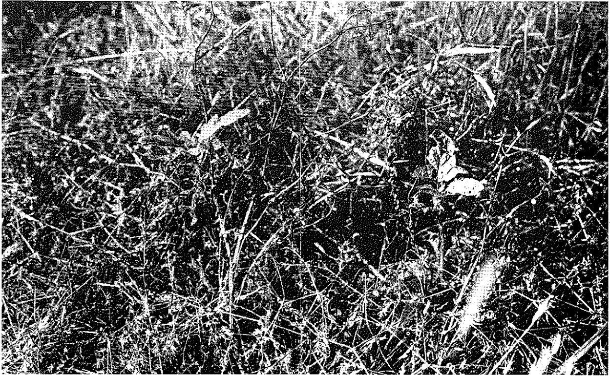
Figure 3. Paraquat applied PPF killed all existing weeds except horsenettle.