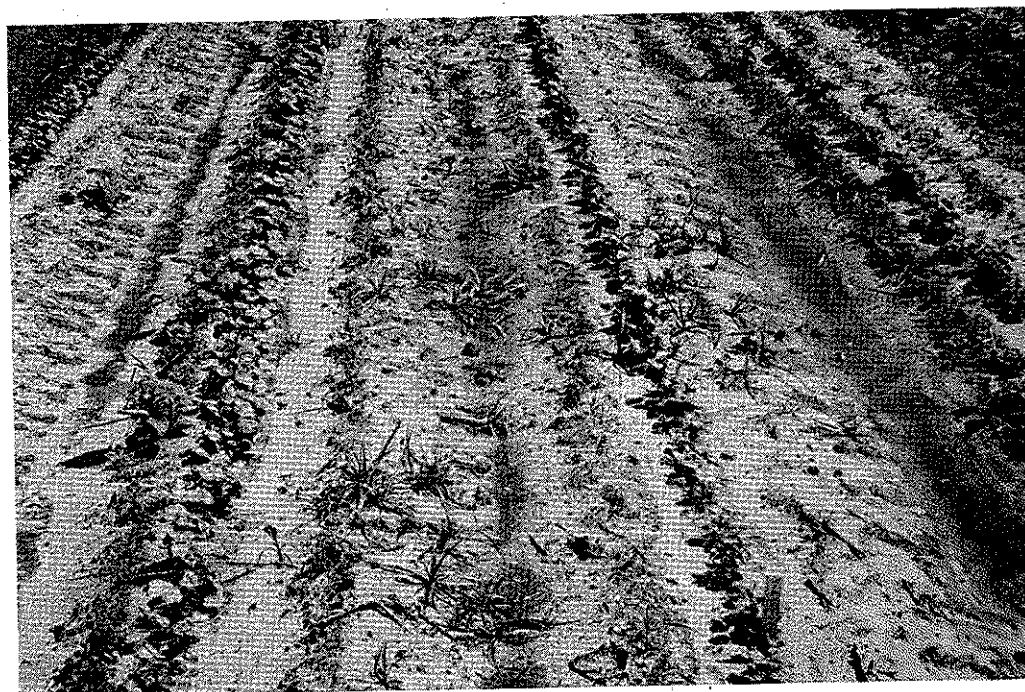
1.5 lb/A norflurazon (left) and 1.5 lb/A fluometuron (right), both applied preemergence (photographed 33 days after treatment).

2 Values within years followed by a common letter are not different (P = .05) according to Duncan's New Multiple Range Test.