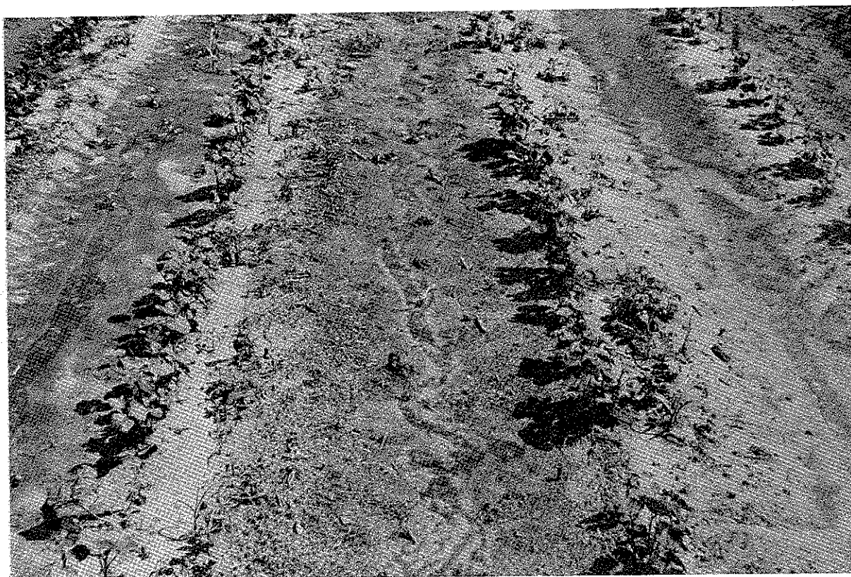
1 lb/A profluralin plus 1.5 lb/A fluometuron tank mix, preplant incorporated (photographed 33 days after treatment).