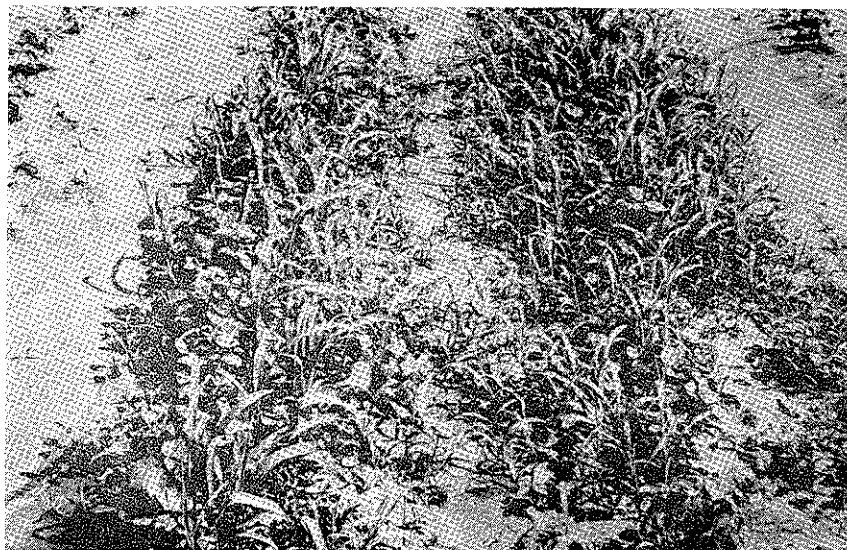
No herbicide (photographed 33 days after planting).

Sequential applications of several herbicides (application preplant incorporated followed by preemergence application) are now registered for control of weeds in cotton. However, cotton producers often want to apply herbicides as tank mixes (two herbicides mixed in the same tank and applied preplant incorporated) to reduce expense and conserve time by eliminating a trip over their fields. Therefore, we investigated the feasibility of tank mixes of selected herbicides for control of annual broadleaf weeds and grasses in cotton.