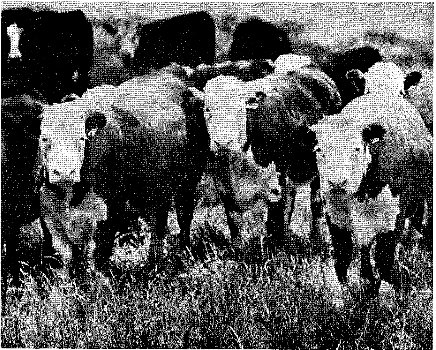
Brown Loam steers on winter pastures.