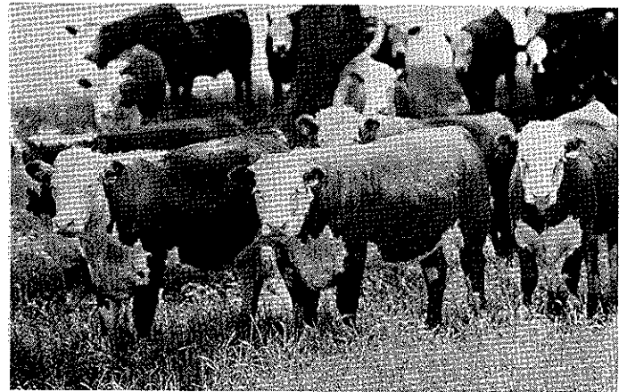
F 1 heifers on winter pasture, May 1974