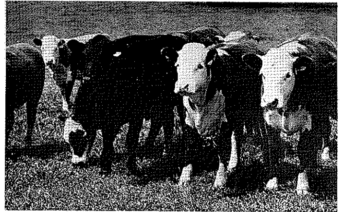
Yearling steers on winter pasture.